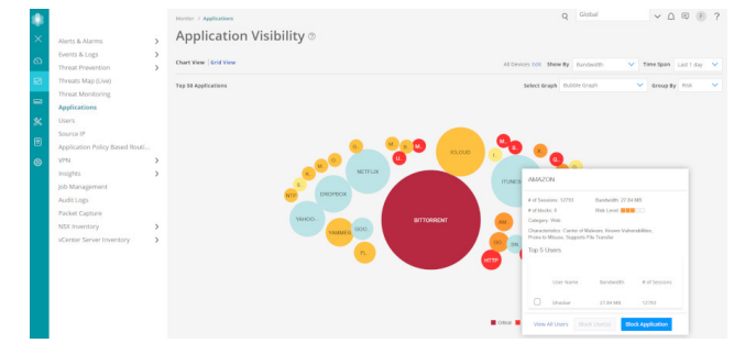
Figure 3: Application Visibility Dashboard

With consistent security policies that follow the user, device, and application without having to copy over or recreate rule sets, Juniper Secure Edge makes it easy to deploy cloud delivered application control, intrusion prevention, content and Web filtering, and effective threat prevention without breaking visibility or security enforcement.